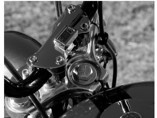
Figure 1: Placement option

Placement: Determine the best placement of the microSpeed™ speedometer for your application. This could be on the top clamp, gas tank, or riser. Make sure that you will be able to reach and touch the screen in order to operate the different modes and reset the trip meters. Once you have determine the location, determine the path for the wires. Since wires exit the back of the casing on lower left side you may want to drill a hole big enough to fit wires. Make sure to protect wires from sharp edges! Alternatively, you could mount the speedometer slightly overhanging the surface and route wires in front of the mounting surface. Clean the surface and mount the speedometer using the VHB tape provided. Press and hold firmly in place for at least 10 seconds.